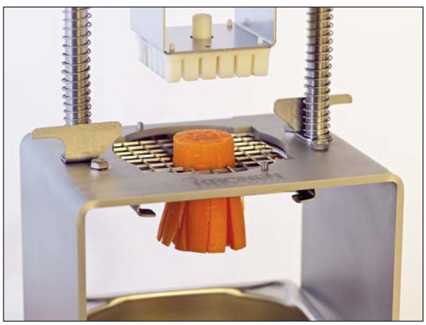
Stick Cutter 10x10mm for vegetables